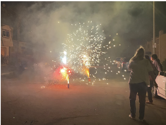
Fireworks in a Huntington Beach neighborhood on July 4, 2021.